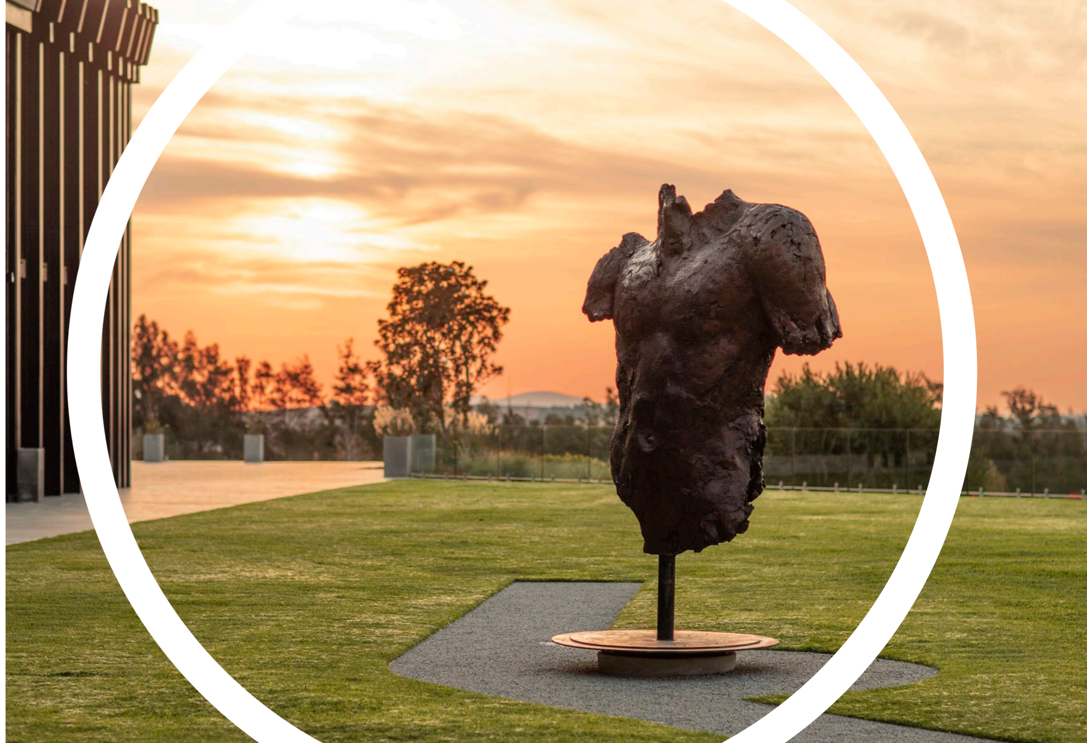
TORSO I 2017 Bronze on Steel 2450 x 1680 x 700 mm Edition of 6