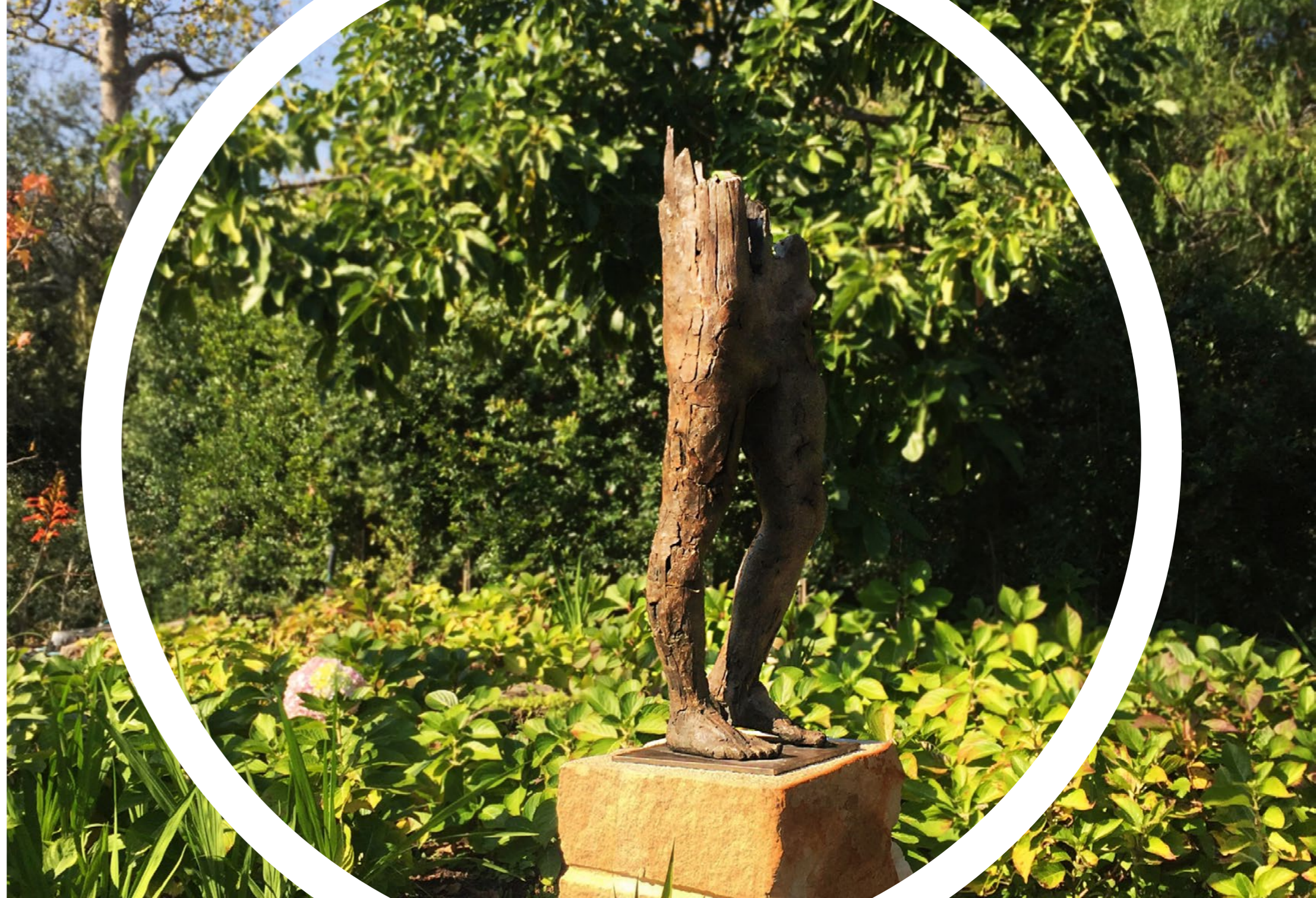
DE-TRUNK 2015 Bronze on Steel 1400 x 400 x 300 mm Edition of 12